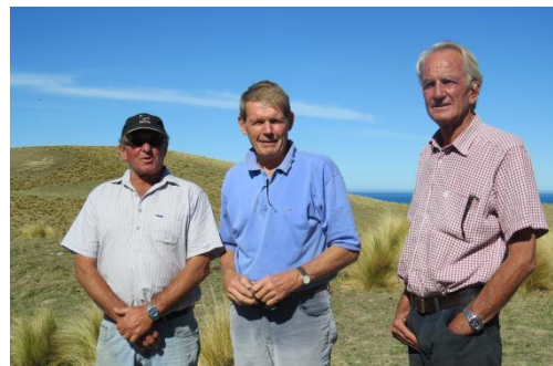
East Coast elder statesmen

Feedback from farmers was get lamb growth rates up before mating hoggets.